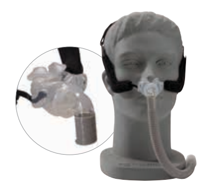
The Aloha™ Nasal Pillow System is the perfect fit with IntelliPAP

Encrypted usage data codes that can be communicated by phone, e-mail or text to generate compliance and clinical reports